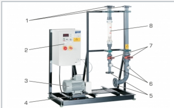
1 flange connections to connect HL 962 to HL 962.30, 2 switch box with displays and controls, 3 electric motor, 4 mounting plate for test pump, 5 flange connections for test pump, 6 manometer, 7 valve, 8 flow meter