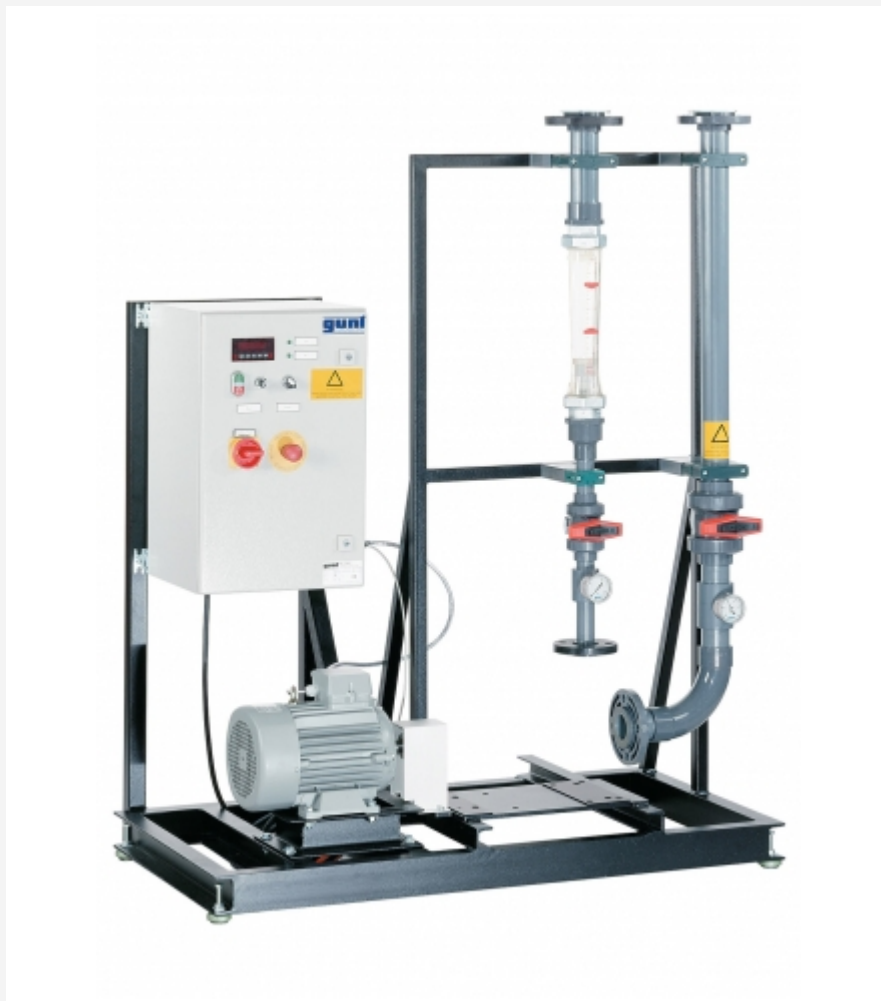
The illustration shows a similar unit.